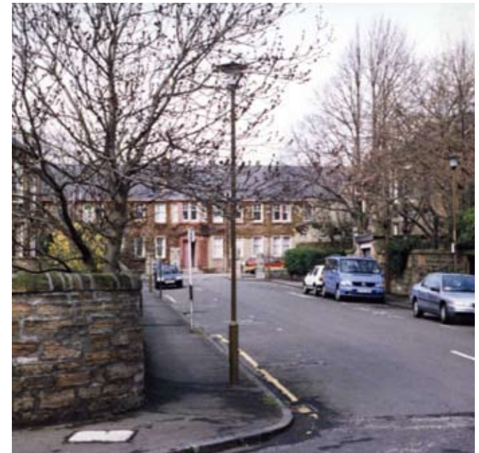
view of existing facility